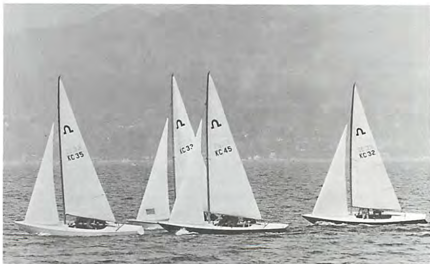
Solings in English Bay