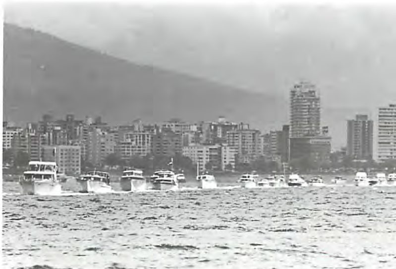
General Quarters! — all ahead main engine.